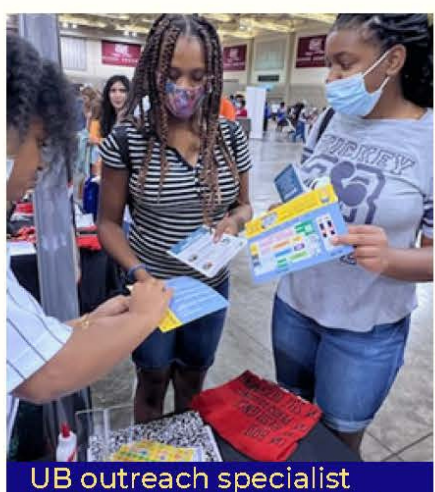
assisting UB students at Back to School Bash.

School Starts August 8, 2022 and UB starts September 17, 2022.